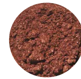
KTZ® MISTERIOSO COPPER