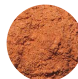
KTZ® BOLERO CROMATICO