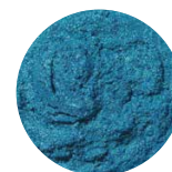
KTZ® COLORSET BlueGreen