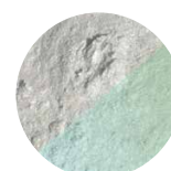
KTZ® SHIMMER GREEN