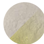
KTZ® EXTRAFINE GOLD

* Not recommended for eye area due to large particle size