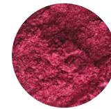
KTZ® SM CINNABAR