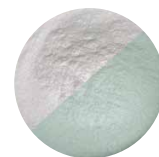
KTZ® G INTERVAL GREEN

TiO 2 - Titanium Dioxide Fe 2 O 3 - Red Iron Oxide Fe 3 O 4 - Black Iron Oxide