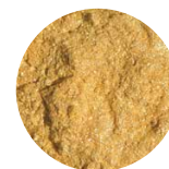
KTZ® SUNBURST GOLD