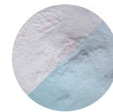
KTZ® SM INTERVAL BLUE