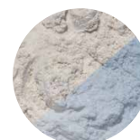
KTZ® INTERVAL BLUE