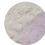
KTZ® INTERVAL VIOLET