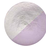
KTZ® G INTERVAL VIOLET