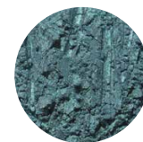
KTZ® MISTERIOSO GREEN