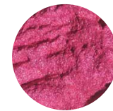
KTZ® CELANDON SHIMMER RED