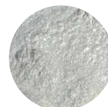
KTZ® STELLAR WHITE