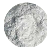
KTZ® GLAM FLAKE