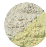
KTZ® INTERFINE GOLD