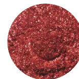
KTZ® ROUSSILLON SHIMMER