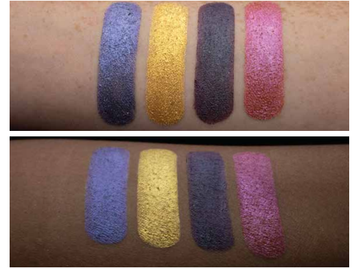
FROM LEFT TO RIGHT: KTZ® MISTERIOSO BLUE, KTZ® CELANDON GOLD, KTZ® SM MAGENTA & KTZ® FOLIAGE FLUTTER