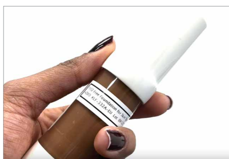
Application of KLF-332A-EU over Skin Type VI