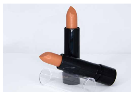
Formula: KLP-317-EU - Soft Lips Brilliant Natural Lipstick TiO_2 Free Nude Shade